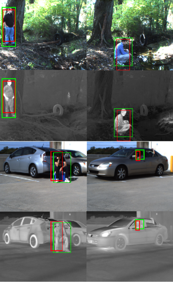
Figure 3. Example detections using the MSDS pedestrian detector. Green is ground truth, red is from the MSDS detector.